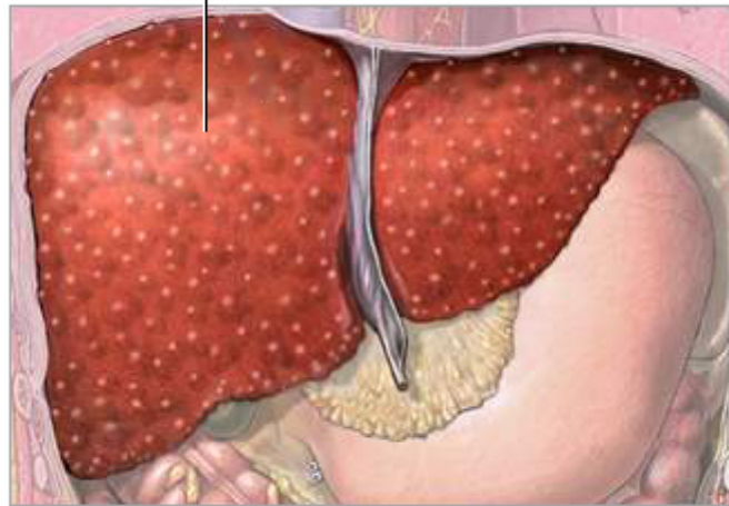
Cirrhosis of the liver